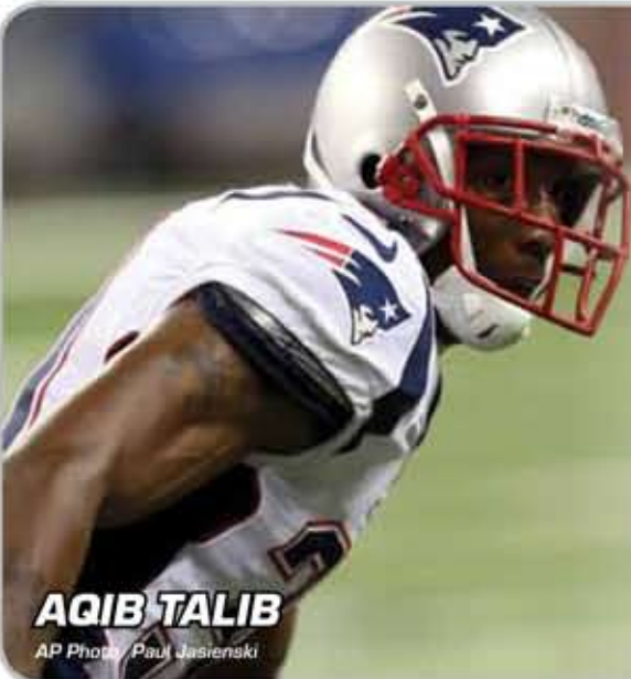
AQIB TALIB