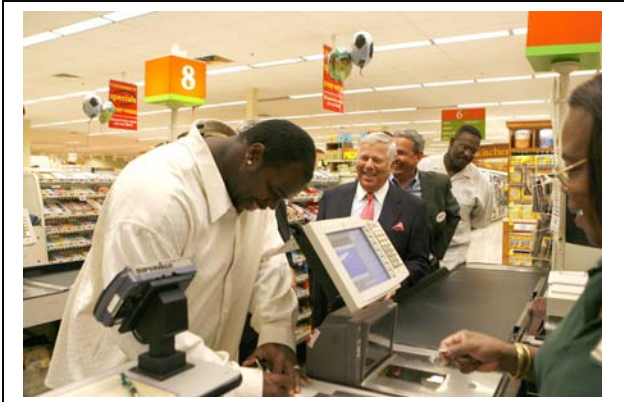
Patriots Chairman and CEO Robert Kraft looks on as Vince Wilfork purchases a gold paper football at Shaw's in Mansfield, Mass. as a part of the Kids Café fundraising campaign. The football, which costs $6.65, will feed a child a hot meal for a week.

The New England Patriots Charitable Foundation, Shaw's Supermarkets and The Greater Boston Food Bank have kicked off a joint fundraising campaign to support local Kids Café programs and food banks throughout New England.